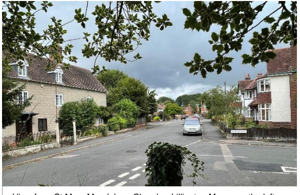
View from St Mary Magdalene Church – Lillington Manor on the left, Manor Farm House at the end of Farm Road

The village of Lillington grew up around St Mary Magdalene Church, the Manor House, and Manor Farm. This area, which is bounded by Cubbington Road, Lillington Road and Lime Avenue, includes the following -