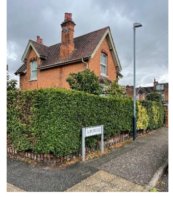
<u>No 1 – the only house address in</u> Elm Road

Farm Road (originally Farm Lane) (Before 1885) – Leads from St Mary's Church and the Manor House to Manor Farm on Lime Avenue.