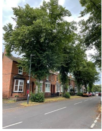
Lime Avenue – towering lime trees and the first houses to be built in Lime

Inglewood Close (1959) – cul de sac of 7 bungalows off Cubbington Road. Origin of name unknown.