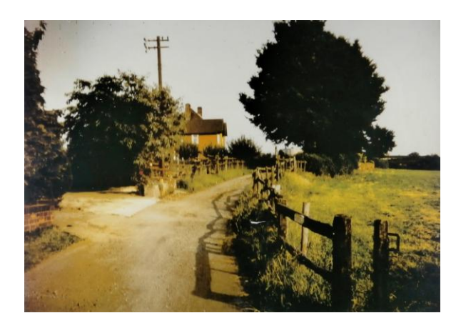
<u>Stud Farm and Epsom Road</u>