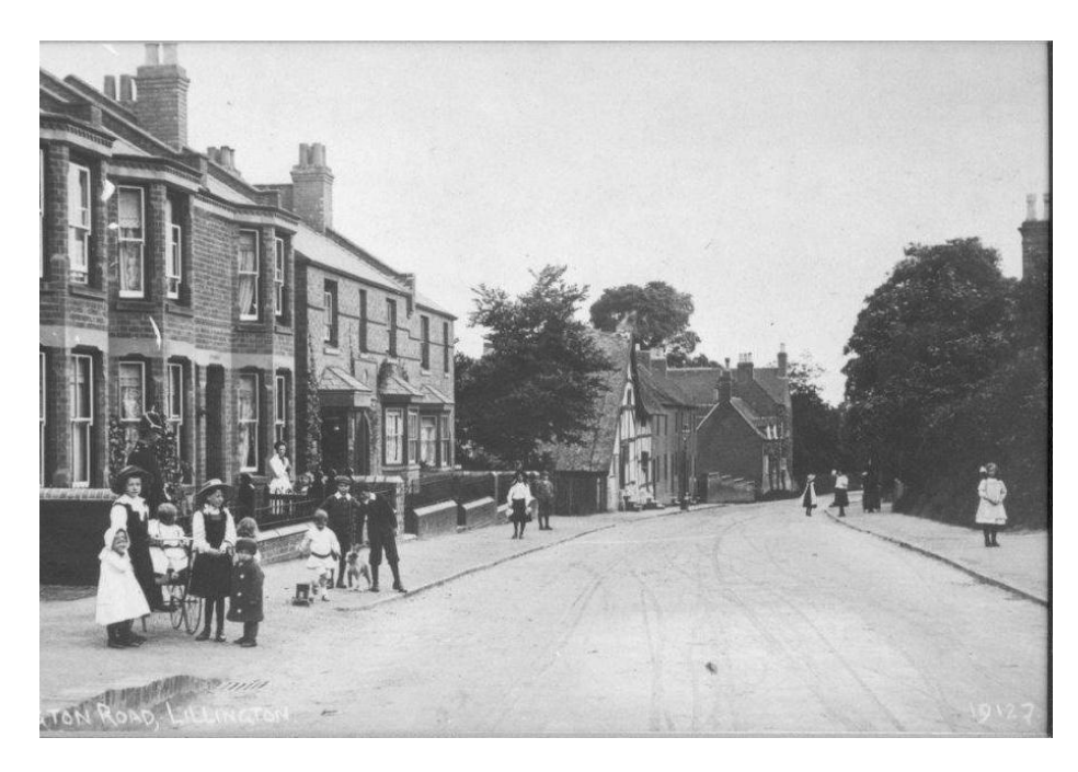
Social distancing in Cubbington Road in the 1900s