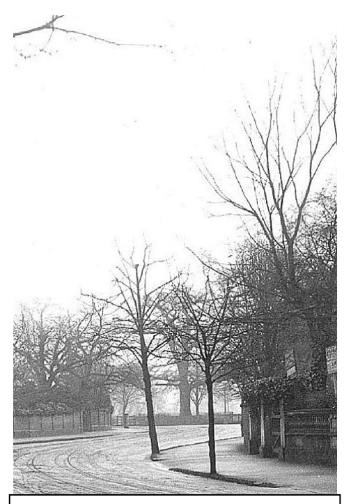
Looking down Lillington Avenue towards the Midland Oak in the early 1930s.